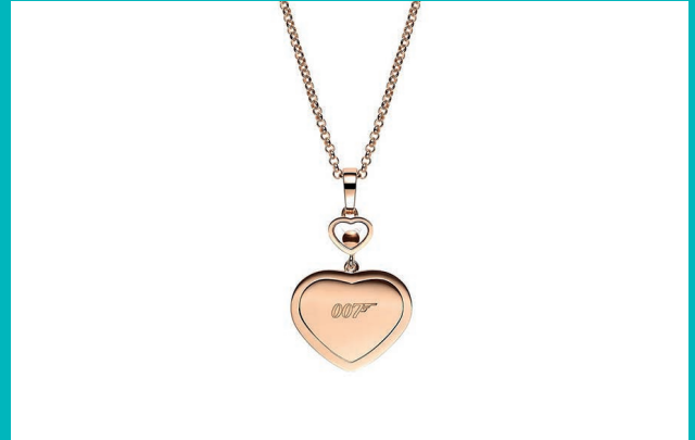
The Happy Hearts Golden Hearts Collection

The necklace pictured opposite currently retails at £6,520. As with all luxury jewellery brands the prices continue to rise. When was the last time your jewellery was professionally appraised? Is your insurance cover adequate in the event of a claim?