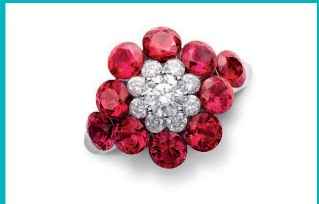
Chopard Magical Setting